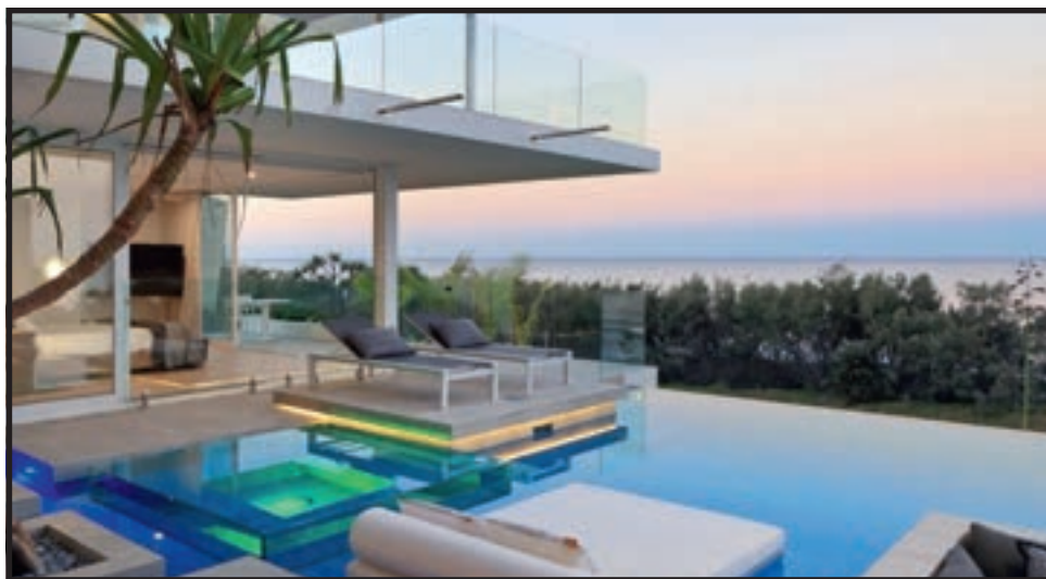
Paul Clout Design

The HIA-iLandscape Housing Awards Sunshine Coast/Wide Bay showcased stunning work by our region's housing design and construction industry.